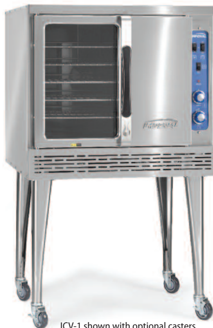
ICV-1 shown with optional casters

Four bearings per door extend the life of the door mechanism.